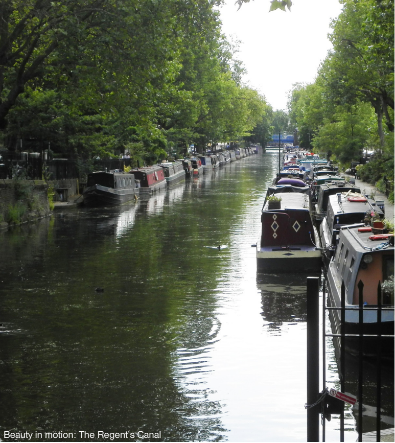
Beauty in motion: The Regent’s Canal

“There would be nothing to make the canal of Venice more poetical than that of Paddington, were it not for its artificial adjuncts” wrote Lord Byron, the English poet, in the early 1800s. And so began the first comparisons between the southern Italianate part of Maida Vale and Venice itself. The point at which the Grand Union Canal and the Regent’s Canal meet at Blomfield Road became officially known as ‘Little Venice’ in the 1950s. Around this time, the area grew increasingly fashionable with its large detached and semi-detached stucco fronted villas and literary figures such as Christopher Fry, the playwright, and Elizabeth Jane Howard, the novelist, made it their home. The canal, woodland and greenery in this picturesque location has indeed attracted and inspired artists for centuries – Paul Verlaine’s 1874 poem ‘La rivi re dans la rue’ or ‘The river in the street’ describes the canal. Robert Browning, the Victorian poet, famously lived at 19 Warwick Crescent from 1862 until 1887 and Katherine Mansfield, the celebrated writer, stayed at Beauchamp Lodge (now 2 Warwick Crescent) from 1908 till 1909. Over the years Little Venice has become ever more desirable and in the early 1970s, from a barge on the canal at Blomfield Road, entrepreneur Richard Branson started his Virgin empire.