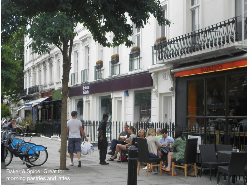
Baker & Spice: Great for morning pastries and lattes