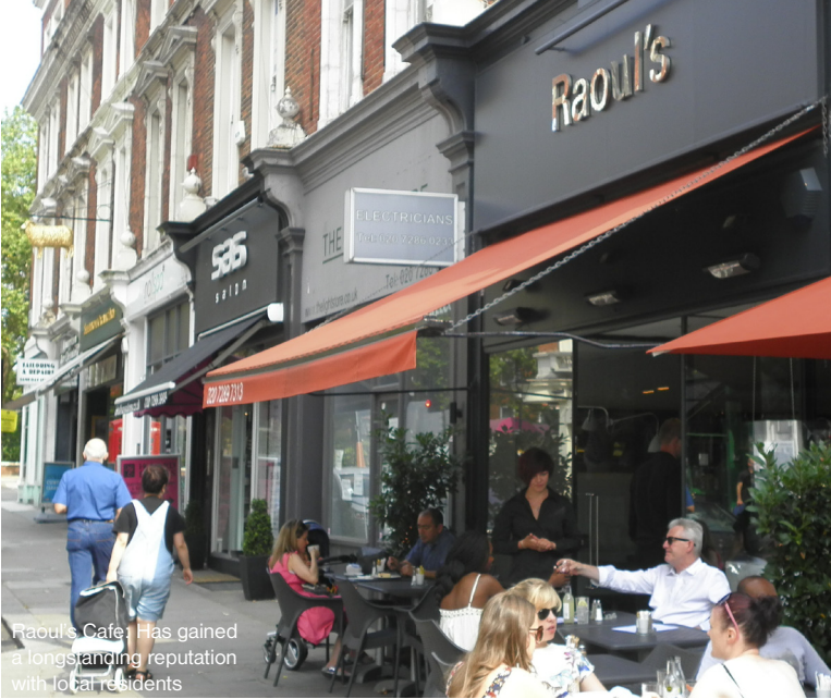
Raoul’s Cafe: Has gained a longstanding reputation with local residents