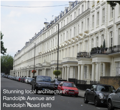
Stunning local architecture: Randolph Avenue and Randolph Road (left)