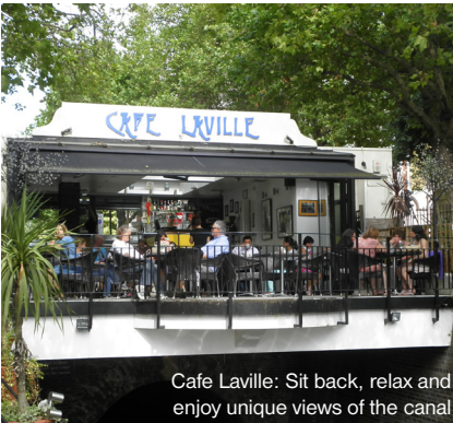
Cafe Laville: Sit back, relax and enjoy unique views of the canal