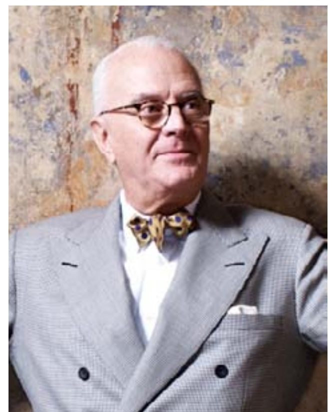
Right: Manolo Blahnik.