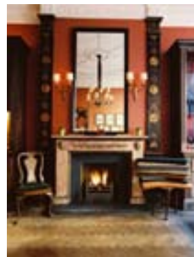
Left: tailors Anderson & Sheppard in Old Burlington Street.