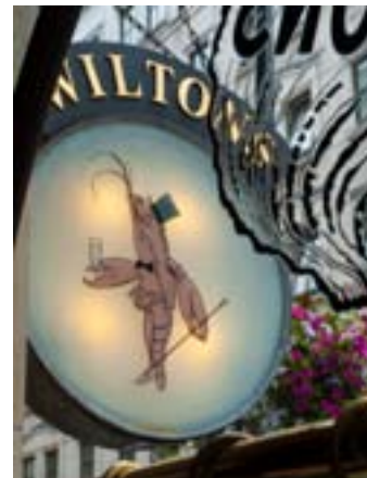
Above: Wiltons on Jermyn Street.