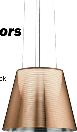
Phillippe Starck suspension lamp with bronze lining £334