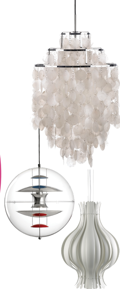
Three iconic Verpan retro classic designs. Top £725, middle £1,395, bottom £995