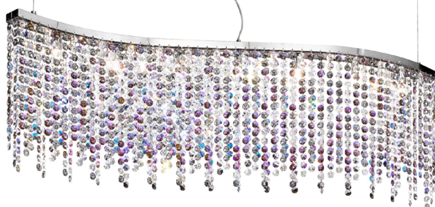
Austrian crystal chandelier, a stunning centrepiece £3,150