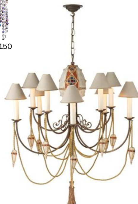
Russian "egg" chandelier available with matching wall lights £1,920