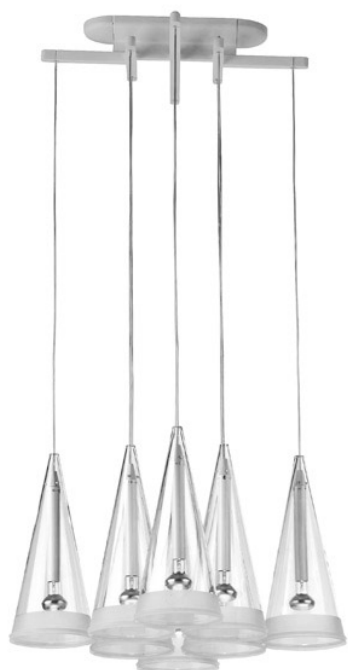
Italian designed hand blown glass eight lamp pendant £1,200

All lights are available from The Lighting Store www.thelightingstore.co.uk 020 8731 8601