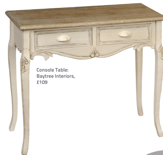
Console Table: Baytree Interiors, £109