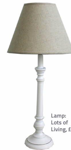
Lamp: Lots of Living, £26