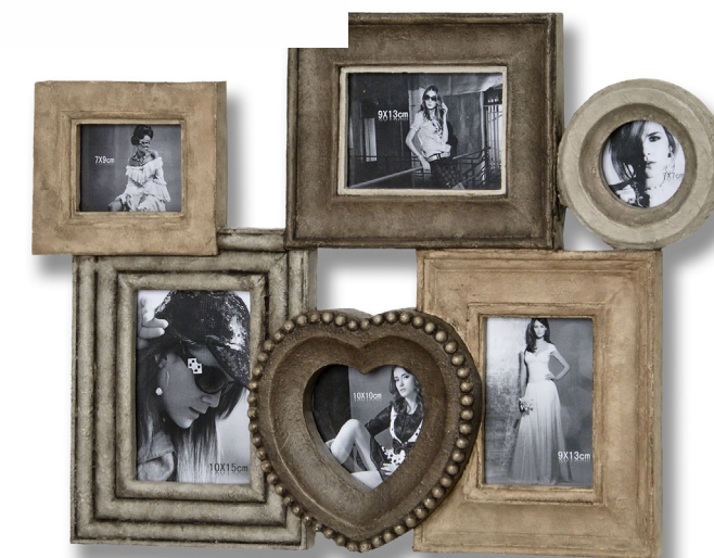
Multiframe: Nordal, £29