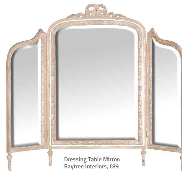
Dressing Table Mirror: Baytree Interiors, £89

Here's what the interiors expert Emily Peck, Editor of ACHICA Living , has to say about the current trend: "When you're decorating, going back to basics with cool and airy neutral finishes and natural materials in their simplest form helps to create a serene backdrop at home. Choose simple yet stylish storage pieces, beautifully uncomplicated wooden furniture in natural and pale painted finishes as well as accessories in cool, ecru and earthy cream shades. These items will help reflect the light round your room enhancing the sense of space. This look also creates a base to the room scheme, which is easily adaptable season after season – when you tire of the look, simply introduce a pop of colour in soft furnishings to update the look in an instant. Neon yellow or zesty orange are on trend and would particularly work well with neutral shades".