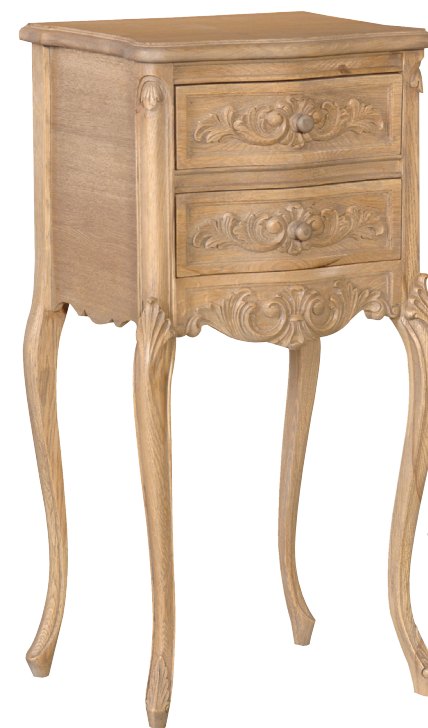
Two Drawer Unit: Baytree Interiors, £149