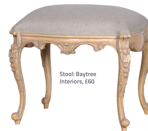
Stool: Baytree Interiors, £60