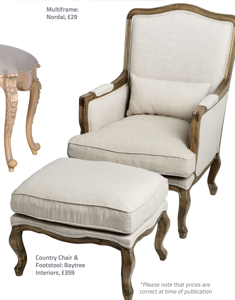
Country Chair & Footstool: Baytree Interiors, £359